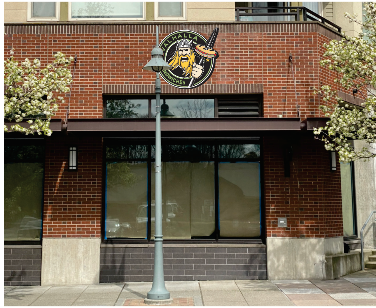
PROPOSED SIGN A OPTION 1 SCALE: 1/4" = 1'

ATTACHMENT DETAIL: 3/8" LAG BOLTS, 3' O.C. AROUND EDGE OF SIGN MIN OF (4)