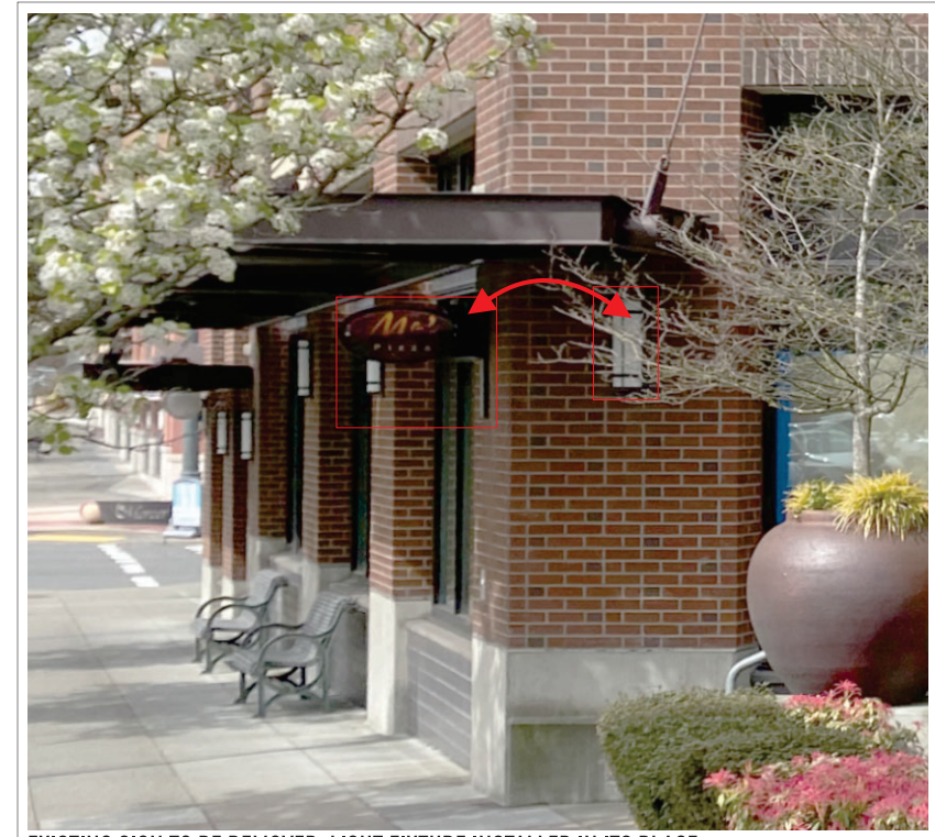
EXISTING SIGN TO BE REMOVED, LIGHT FIXTURE INSTALLED IN ITS PLACE

ATTACHMNET DETAIL: 3/8" X 3" LAG BOLTS THRU MOUNTING BRACKET MIN OF (4)