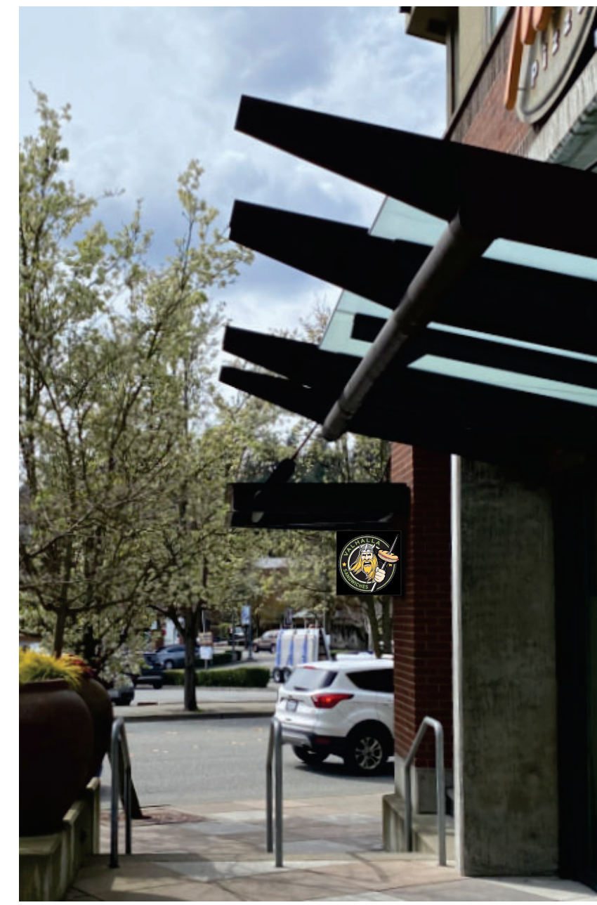
PROPOSED SIGN B